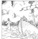
It is I; do not be afraid.

Pray for all the souls of our faithfully departed, eternal rest grant unto them, O lord, and let perpetual light shine upon them .